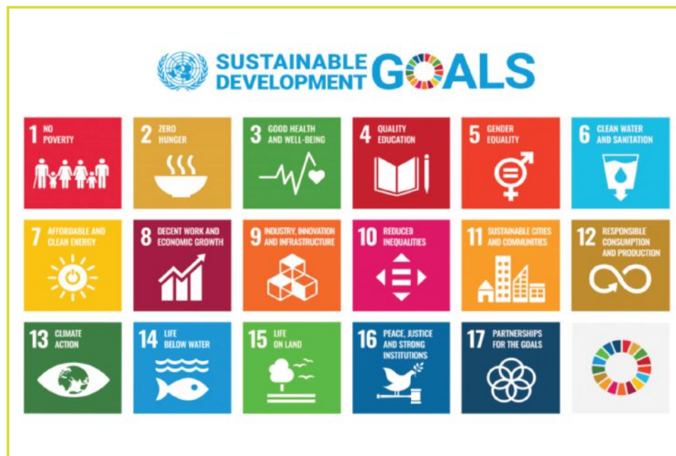
Figure 2 The 17 U.N. Sustainable Development Goals (SDGs).

In a wider context, as an U.N. NGO, the IFMA Foundation's objective is also to contribute to ECOSOC through awareness raising, development of educational programs, policy advocacy, joint operational projects, participation in intergovernmental