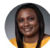
Aykean Matthews Int'l School Port of Spain Port of Spain, Trinidad & Tobago