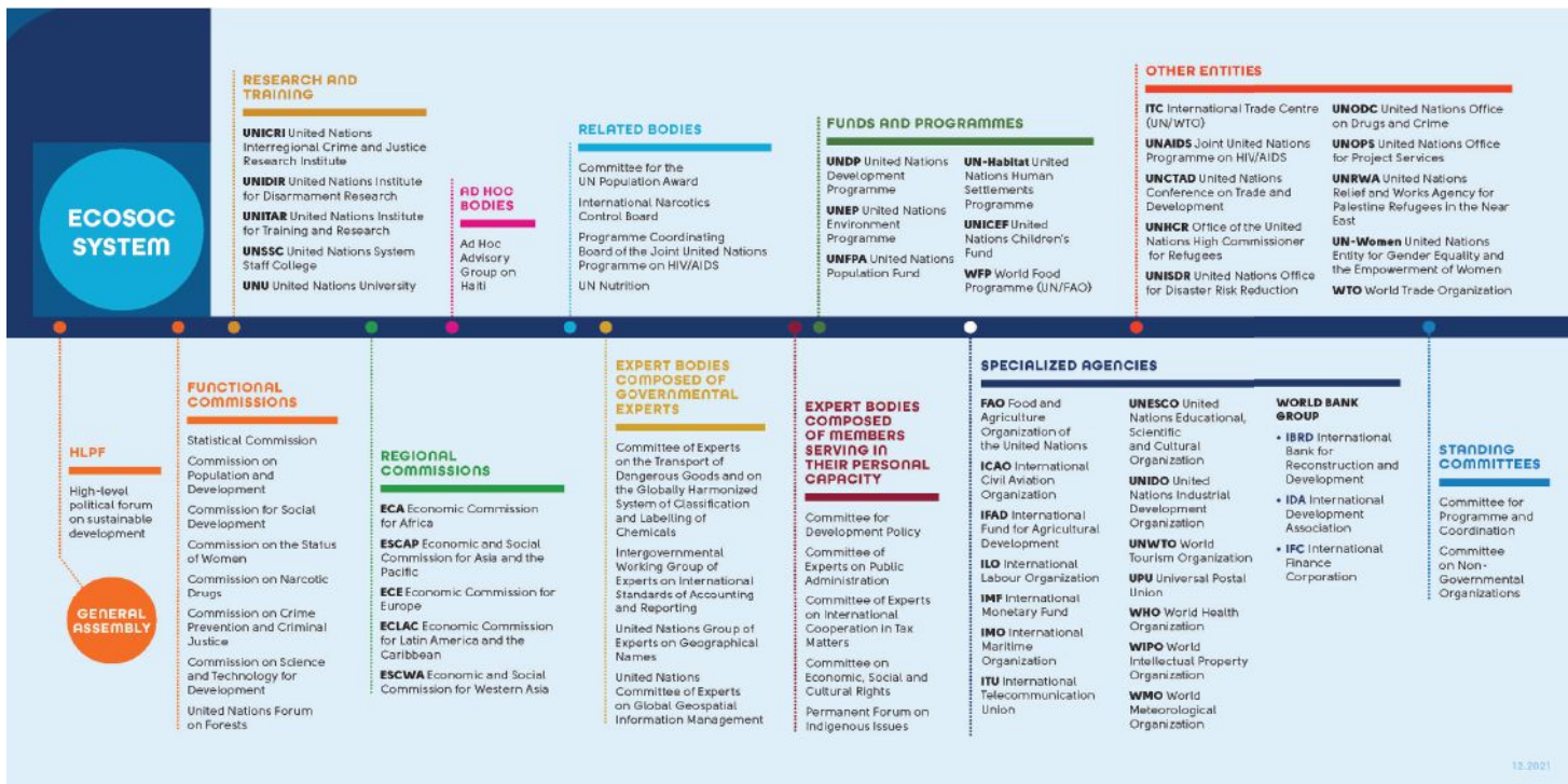
Figure 1 The U.N. Economic and Social Council (ECOSOC) detailed.

The Foundation's seat at the U.N. table through ECOSOC allows for limitless possibilities to advance the FM profession. The Foundation's work is centered around improving social equity by making more FM education programs accessible to women, minority communities, the underserved, the unemployed and the underemployed to fill the much-needed talent gap in the profession. ECOSOC also is particularly interested in strengthening the position of the Global South, the mutual